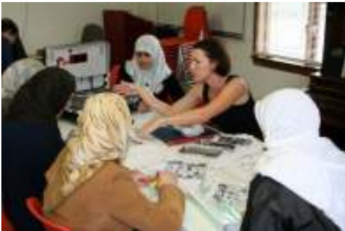
မ့တမ့ၢ်နမၤလိအိၤထဲတဂၤပုၤဒီးသရၣ်တဂၤသ့လီၤ.